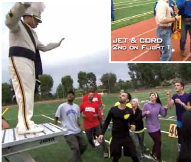
Contestants look for the first clue