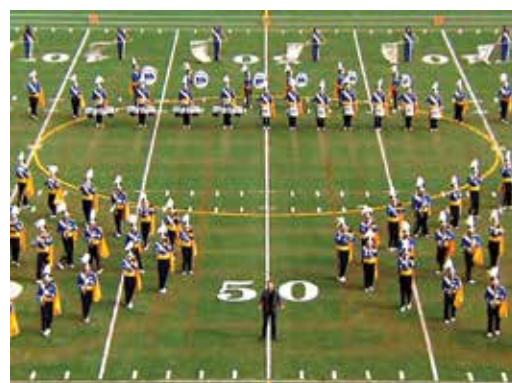
Concluding the introduction