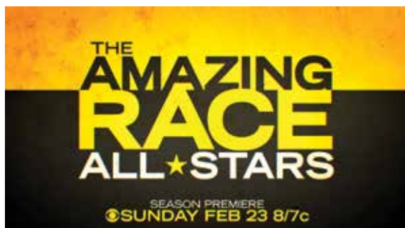
“The Amazing Race” All-Stars premiere