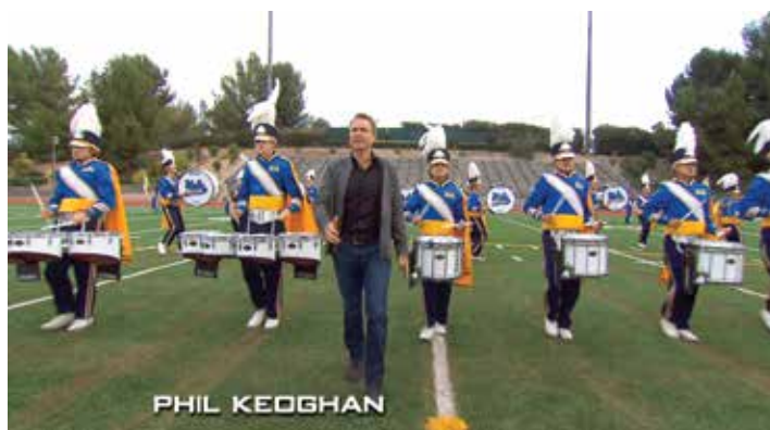
Host Phil Keoghan introduces the band