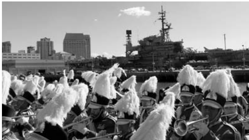
Performing at the Broadway Pier with the USS Midway in the background