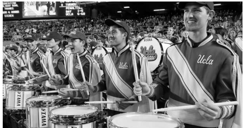
The snare drummers in the stands.