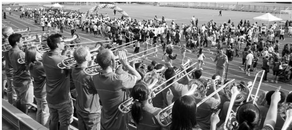
The Varsity Band at the "Dribble For The Cure" event at Drake Stadium