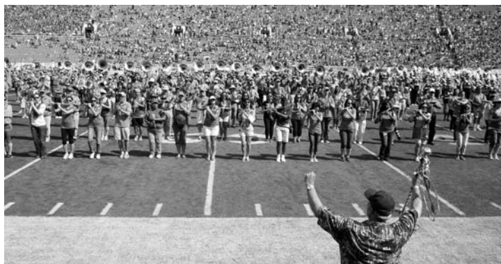
The Band Alumni playing the UCLA Fight Song