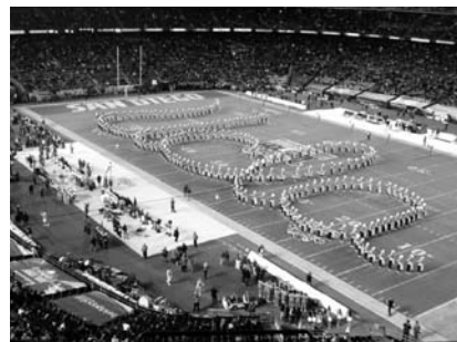
UCLA formation during the Band's Pregame Show