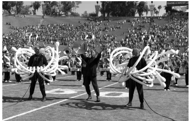
Blue Man Group performing the Star Spangled Banner with the UCLA drumline at the Utah game last fall