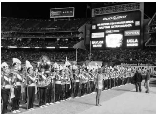
The final formation of the Band's Halftime Show