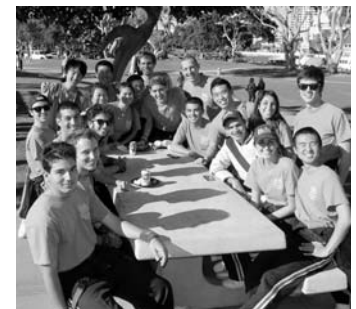
The drumline relaxing before the game