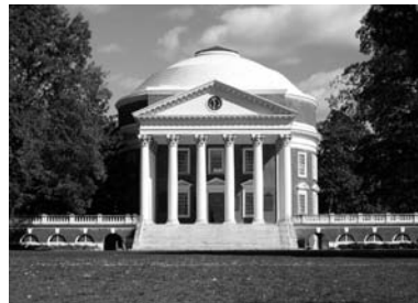
The iconic University of Virginia Rotunda.

The main focus of our Solid Gold Sound Club fundraising this fall will be to send a pep band of about 50 band members to the UCLA vs. Virginia football game in Charlottesville, Virginia, to open the 2014 UCLA football season. Possible side trips would include Monticello, the home of Thomas Jefferson, and other sights around the Washington, D.C. area. This would be the first pep band trip back East for the Band during football season since the UCLA game at Knoxville, Tennessee, in 2009 (which UCLA won 19-15).