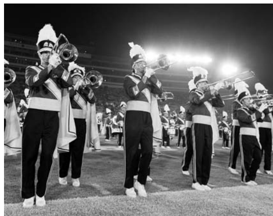
The trombones performing "Strike Up the Band"