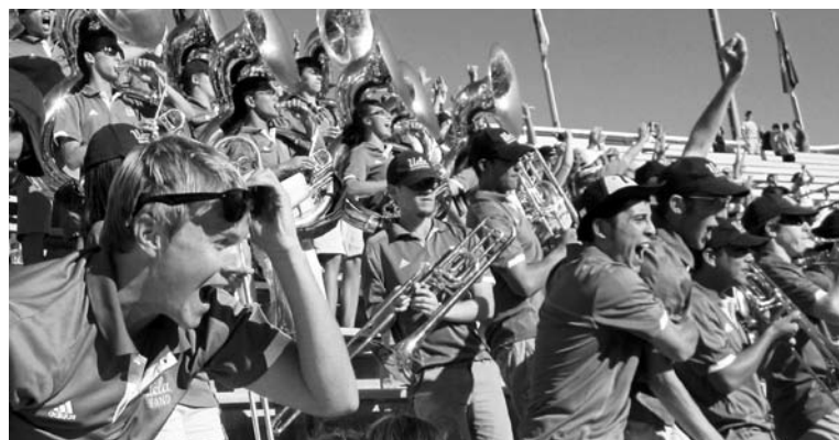
The pep band goes wild as the winning field goal goes through the uprights at the ASU game in Tempe