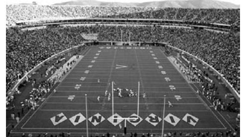
Scott Stadium at the University of Virginia.