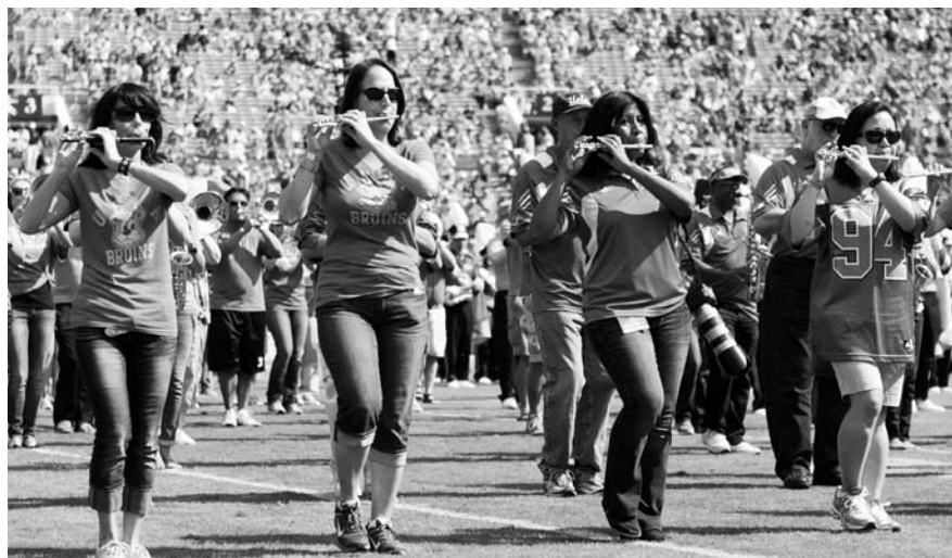
Band Alumni piccolos