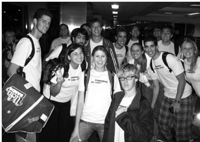
The Sousaphones show off their new section T-shirts as they wait to board the plane to Chicago.

Last year's trip to the Notre Dame game was one of the highlights of the season. The Band flew to Chicago on four separate overnight flights and played rallies on the Navy Pier the night before the game for large groups of UCLA alumni. The Band's halftime performance was shown live on the NBCSports.com website and remained on that site for several months afterwards. Thanks to all of our donors for making this trip possible!