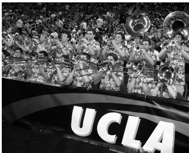
Performing at the UCLA vs. Florida Semifinal game.