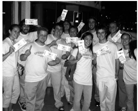
Band members showing off their tickets to the premiere and proudly wearing their “Springfield Correspondence School” T-shirts.