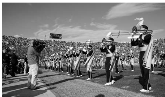
The Band performing "Birdland" at halftime at Notre Dame.