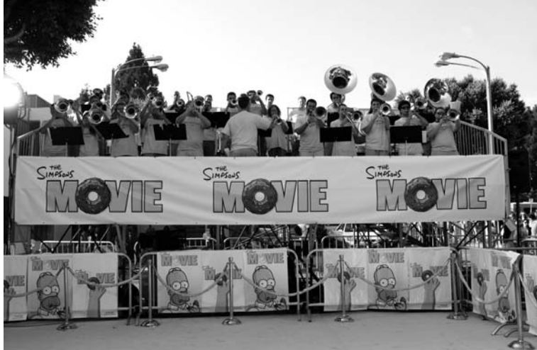
The Band on Broxton Avenue awaiting the arrival of celebrities for the premiere.

The UCLA Band performed at the Village Theatre premiere of The Simpsons Movie, playing “The Simpsons Theme” as a number of celebrities were introduced to the crowd. Stars in attendance included Dan Castellaneta (the voice of Homer), Nancy Cartwright (the voice of Bart), Hank Azaria, Harry Shearer, Creator Matt Groening, Director (and former member of the UCLA Marching Band Tuba Section) David Silverman, David Hasselhoff, Ed McMahon, Efron Ramirez (Pedro in Napoleon Dynamite) and many others.