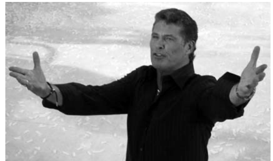
The “Hoff” asking the Band to play the “Night Rider” theme!