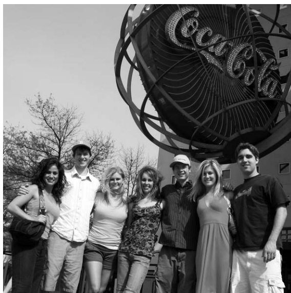
Members of the Band and Dance Team seeing the sights in Atlanta starting with a tour of the Coca-Cola museum.