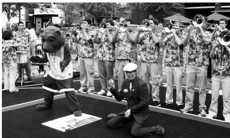
Performing live on ESPN Sportscenter.