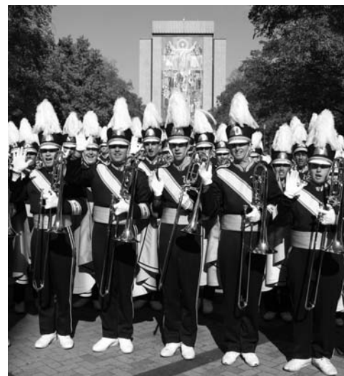
The trombones in front of "Touchdown Jesus" as they enter the Notre Dame Stadium.