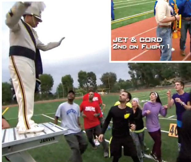
Contestants look for the first clue