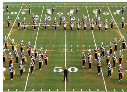
Concluding the introduction