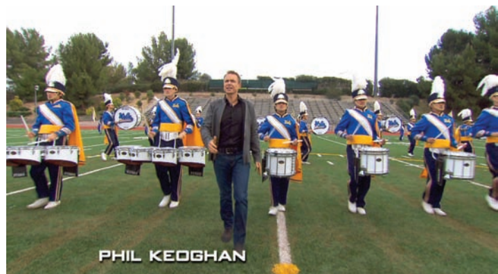
Host Phil Keoghan introduces the band