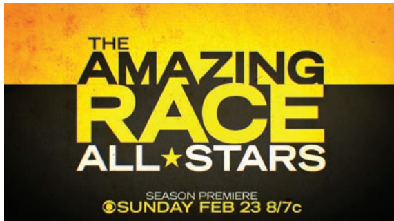
“The Amazing Race” All-Stars premiere