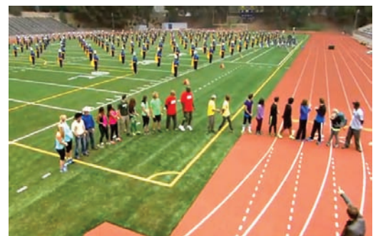
Host Phil Keoghan shows the contestants how the challenge will begin